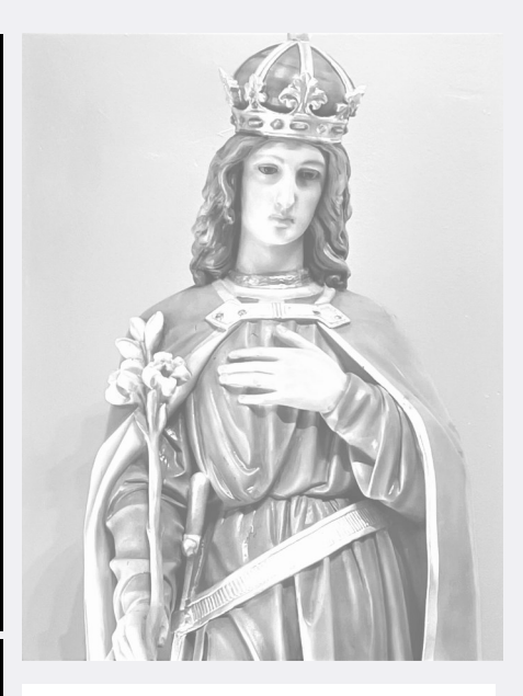
- Saint Kazimierz -

9175 FM 1371 Chappell Hill, Texas 77426 Office: 979-836-3030 Email: office@ststanislauschappellhill.com www.ststanislauschappellhill.com