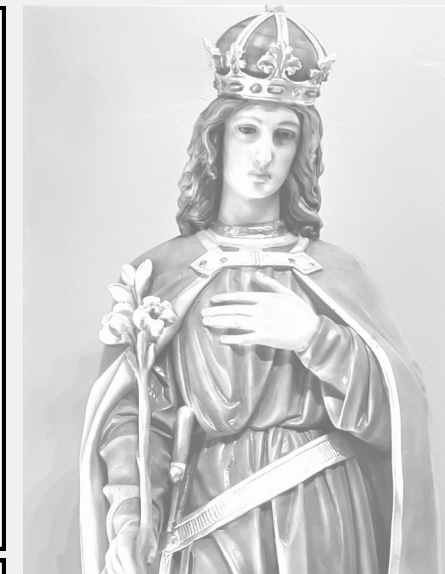
- Saint Kazimierz -