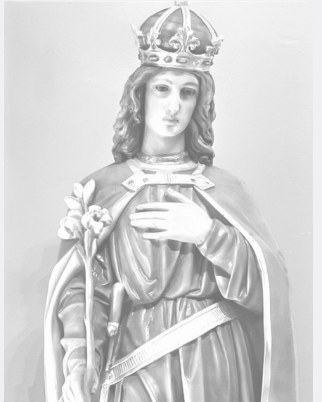
- Saint Kazimierz -

9175 FM 1371 Chappell Hill, Texas 77426 Office: 979-836-3030 Email: office@ststanislauschappellhill.com www.ststanislauschappellhill.com