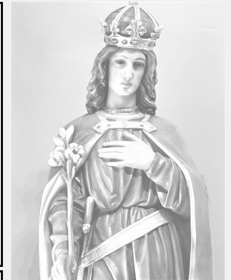
- Saint Kazimierz -

9175 FM 1371 Chappell Hill, Texas 77426 Office: 979-836-3030 Email: office@ststanislauschappellhill.com www.ststanislauschappellhill.com