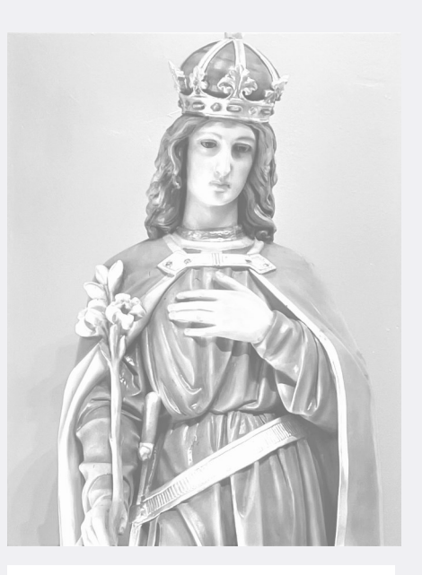
- Saint Kazimierz -

office@ststanislauschappellhill.com www.ststanislauschappellhill.com