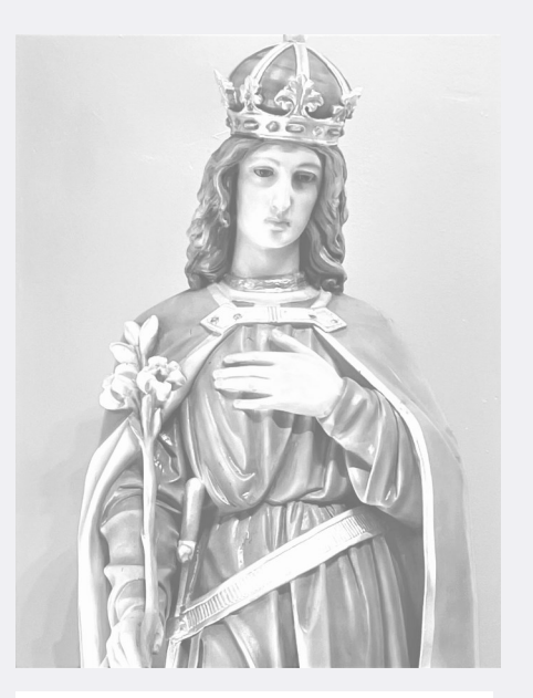
- Saint Kazimierz -

Chappell Hill, Texas 77426 Office: 979-836-3030 Email: office@ststanislauschappellhill.com www.ststanislauschappellhill.com