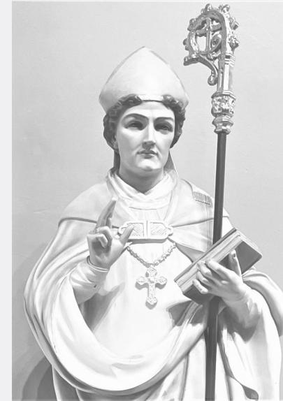
- Saint Stanislaw -