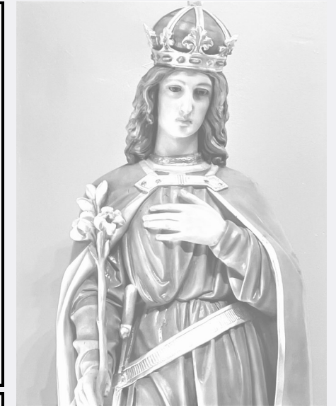
- Saint Kazimierz -